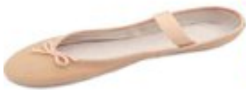
Full sole ballet shoes

Girls · Pink leather ballet shoes with elastic across the front