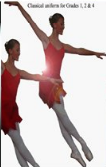
Classical uniform for Grades 1, 2 & 4

Girls · Red princess line leotard Red wrap skirt optional