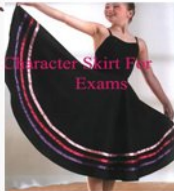
Character Skirt For Exams

Girls · Red princess line leotard Red wrap skirt optional